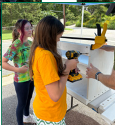
Pictured above and left: Girl scouts organizing and constructing the seed library.