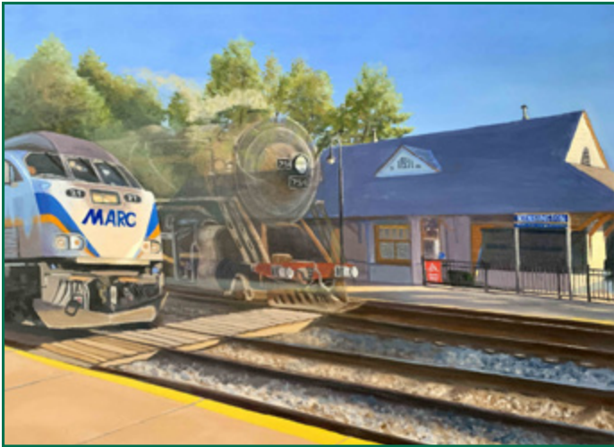
Passage of Time in honor of Alden Schofield