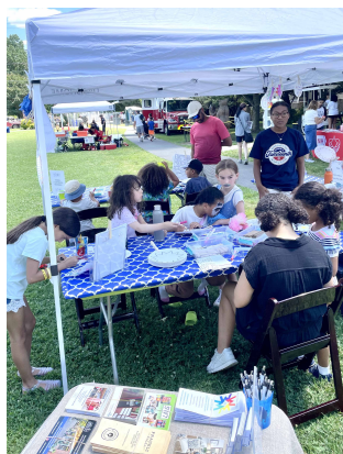
KCAN craft table set up for the kiddos at this year's Juneteenth celebration.