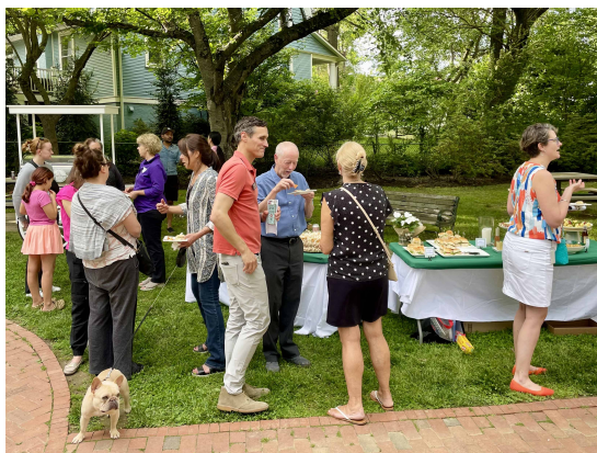
Party by the Fountain—a beautiful day, great food and music—enjoyed by all...even Butters got in on the action!

How can KensingtonCAN! help you? What's important to you and your business? Let us know. We welcome information, ideas, questions, and discussion relevant to the Kensington business community.