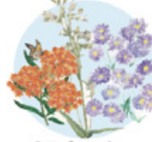
Butterfly weed Aromatic aster Foxglove beardtongue