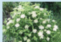
Southern arrowwood viburnum