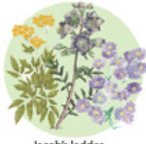
Jacob's ladder Golden Alexander Blue wood aster