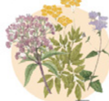
Golden Alexander Coastal plain Joe pye Blue mist flower