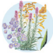
Blue wood aster Spike gayfeather Blue-stemmed goldenrod