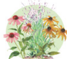
Brown-eyed Susan Purple coneflower Switchgrass