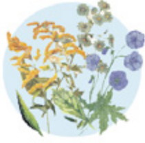
Cranesbill Gray goldenrod White wood aster