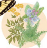
Golden Alexander Virginia bluebell Ostrich fern