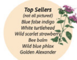
Top Sellers (not all pictured) Blue false indigo White turtlehead Wild scarlet strawberry Bee balm Wild blue phlox Golden Alexander

Tip: Buy at least 3 of each flower type to attract pollinators.