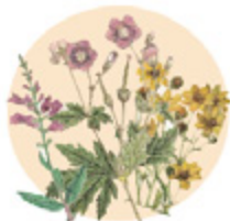
Wild geranium Lance-leaved coreopsis Obedient plant