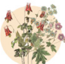
Wild geranium White wood aster Eastern Columbine