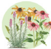
Orange coneflower Purple coneflower Spike gayfeather