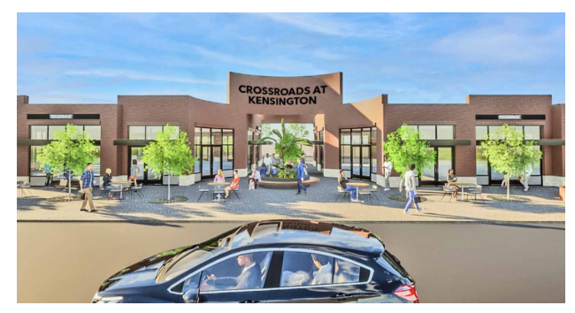
Rendering of Crossroads at Kensington façade as viewed from Connecticut Avenue

At the corner of Connecticut Avenue and Plyers Mill Road, the Crossroads at Kensington replaces the former Hawkins produce stand that had operated out of the defunct former gas station. This project broke ground at the beginning of the year with an expected 12-18 month construction timeline. When complete, Crossroads at Kensington will be a small retail center with six retail bays and ample open space