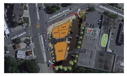
Layout of future Crossroads at Kensington development project

for outdoor seating. Current leases that have been reported include M&T Bank, which will relocate from Montgomery Avenue, Mezeh Mediterranean Grill, Buffalo Wild Wings GO!, and Marathon Deli. Two more tenants will be announced as the project nears completion.