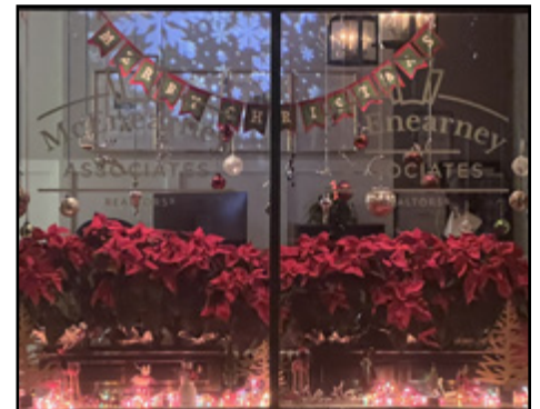
Hon. Mention Business Winner

Silver Spring Animal Hospital 10501 Metropolitan Ave