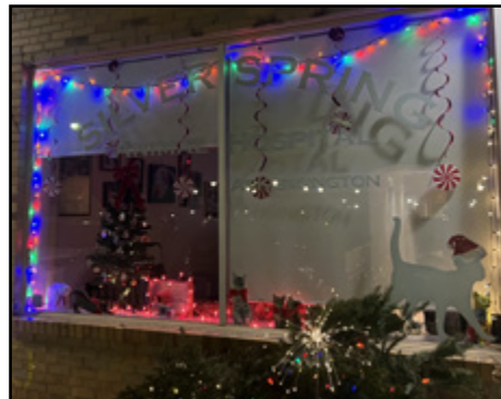
First Place Business Winner