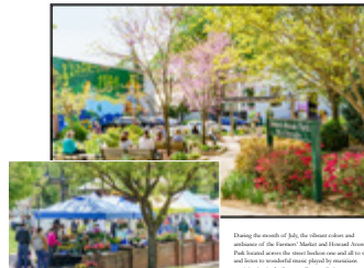
During the month of July, the vibrant colors and architecture of the historic "Baker and Central Avenue Park" located across the street from the town hall and all of its shops and homes is made to make people feel like they are participating in the Summer Concert Series.