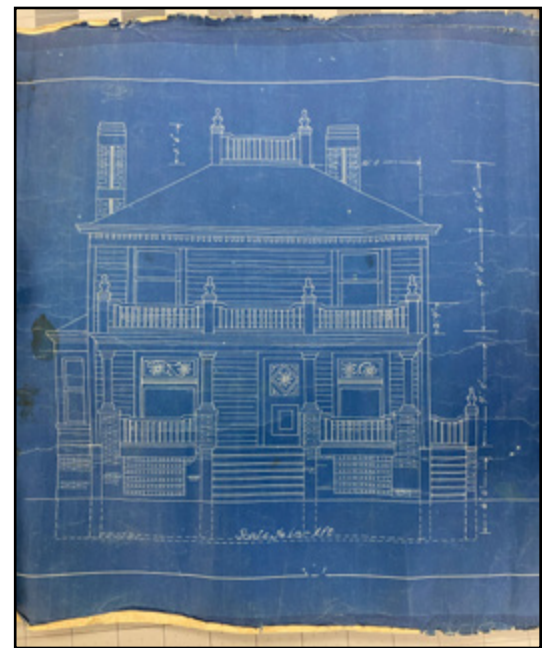
Brittle original house blueprint found in collections.