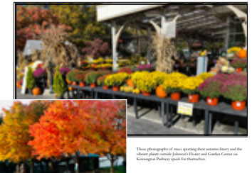
These photographs of trees opening their autumn doors and the vibrant colors of the flowers in the garden are the work of the Kensington Historical Society and the Kensington Parkway group for themselves.