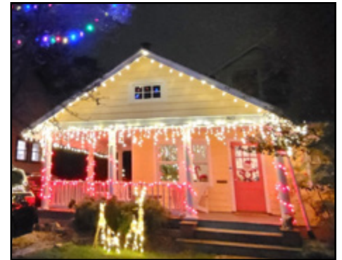
The Winter Wonderland Award