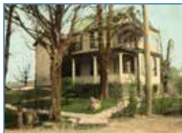
58 St. Paul Street