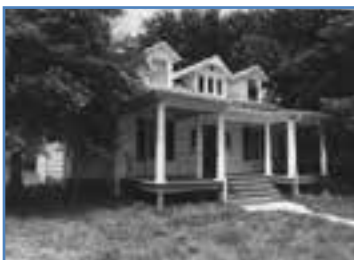
3717 Dupont Avenue

Without historic designation, these historic homes have been lost.