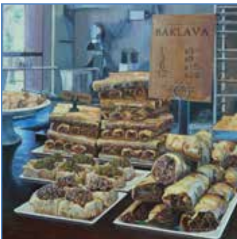
"Baklava Couture," 2017 30x30, oil on canvas