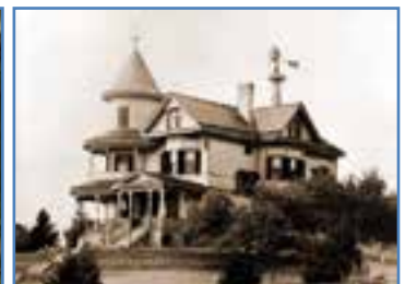
10400 Armory Avenue