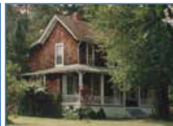
10033 Frederick Avenue