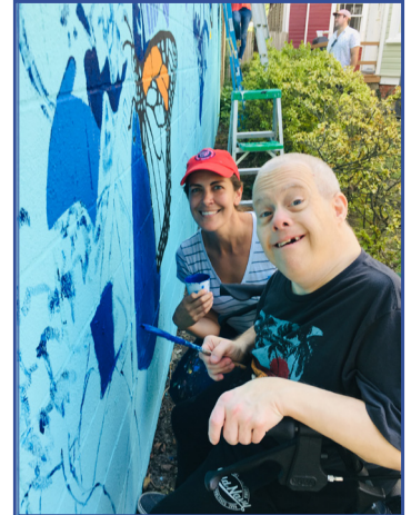
Jubilee clients helped to create the mural.

When the opportunity to work with the Mayor's office and Jubilee on this project arose, I chose to depict a moment in the Monarch butterfly migration for a couple of different reasons.