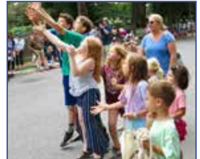
It paid off to be quick and tall when candy was thrown to the crowds.