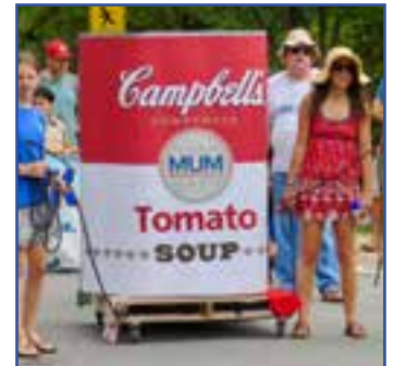
MUM added art with this Warhol soup can.