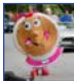
IHOP loves to join in the parade every year!!