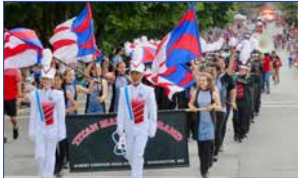
Marching bands came from Einstein, Montgomery Blair and Magruder High Schools.