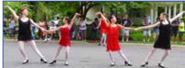
There was a little Charleston in Kensington, along with a variety of other dance troupes.