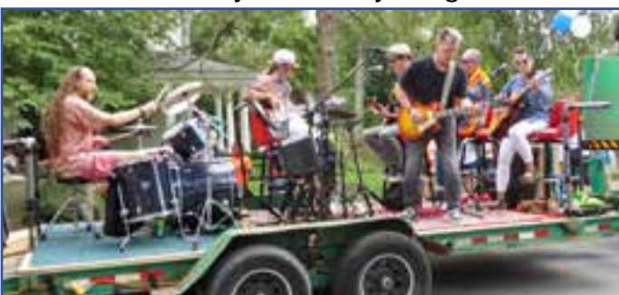
Mayor and Council had the best seats in the house as they watched the entertainment float by.