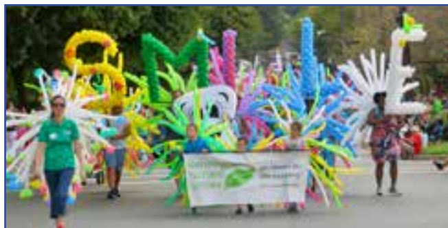
These balloons made us smile, how about you?