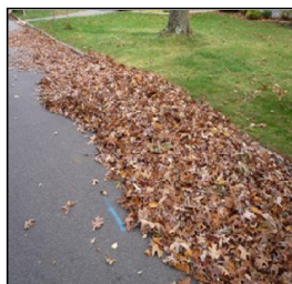
DO NOT place leaves in the street

Please do not include grass clippings, mulch, twigs, or small branches within leaf piles, as this may damage our leaf vacuum. If your leaf pile contains any materials besides leaves, the Crew will not collect your pile, and you will be responsible for bagging the leaves on your own.