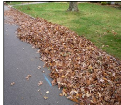
DO NOT place leaves in the street

Please do not include grass clippings, mulch, twigs, or small branches within leaf piles, as this may damage our leaf vacuum. If your leaf pile contains any materials besides leaves, the Crew will not collect your pile, and you will be responsible for bagging the leaves on your own.