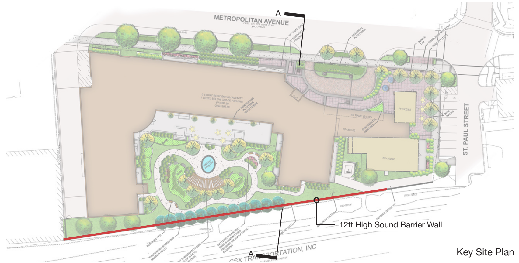
Key Site Plan