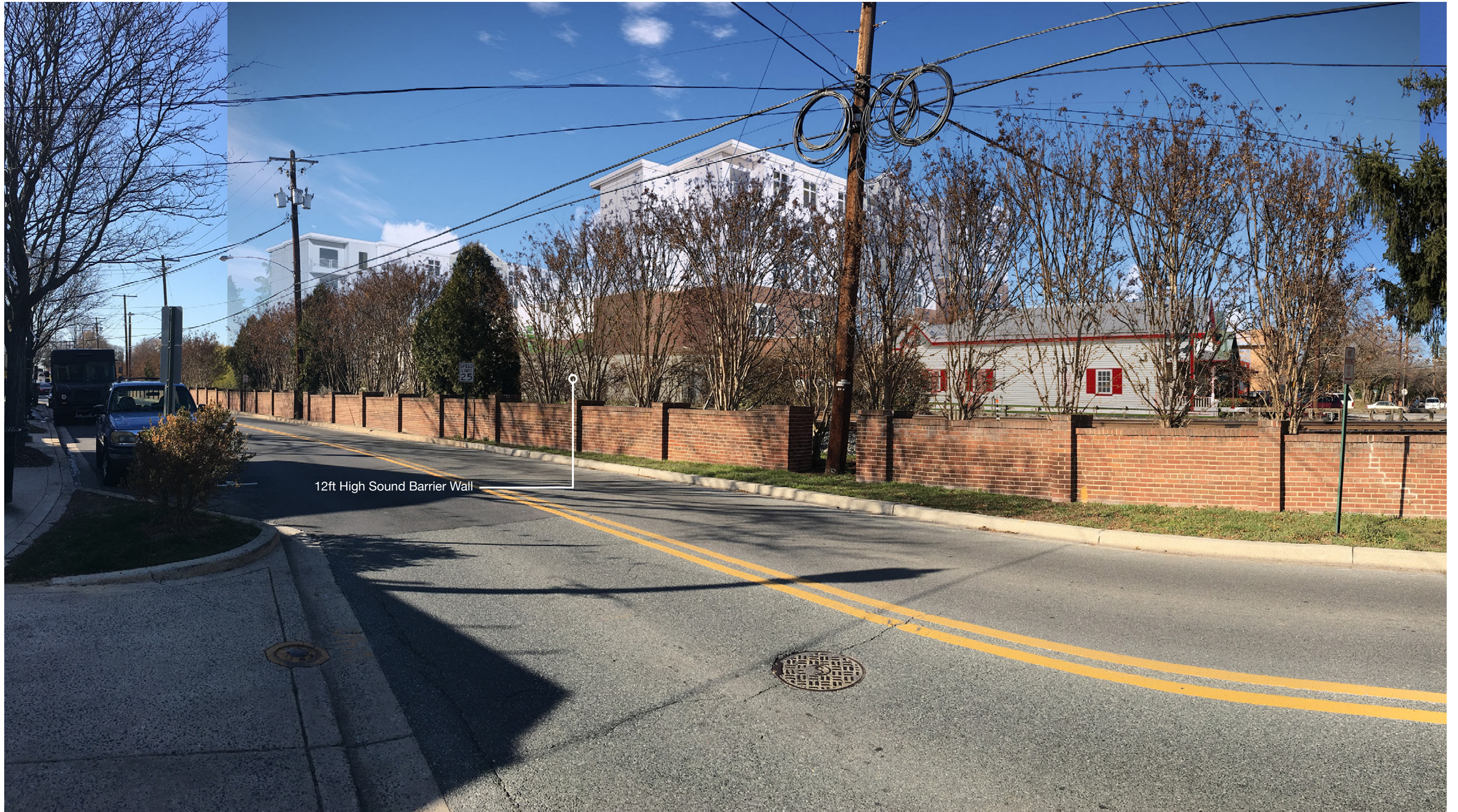
12ft High Sound Barrier Wall