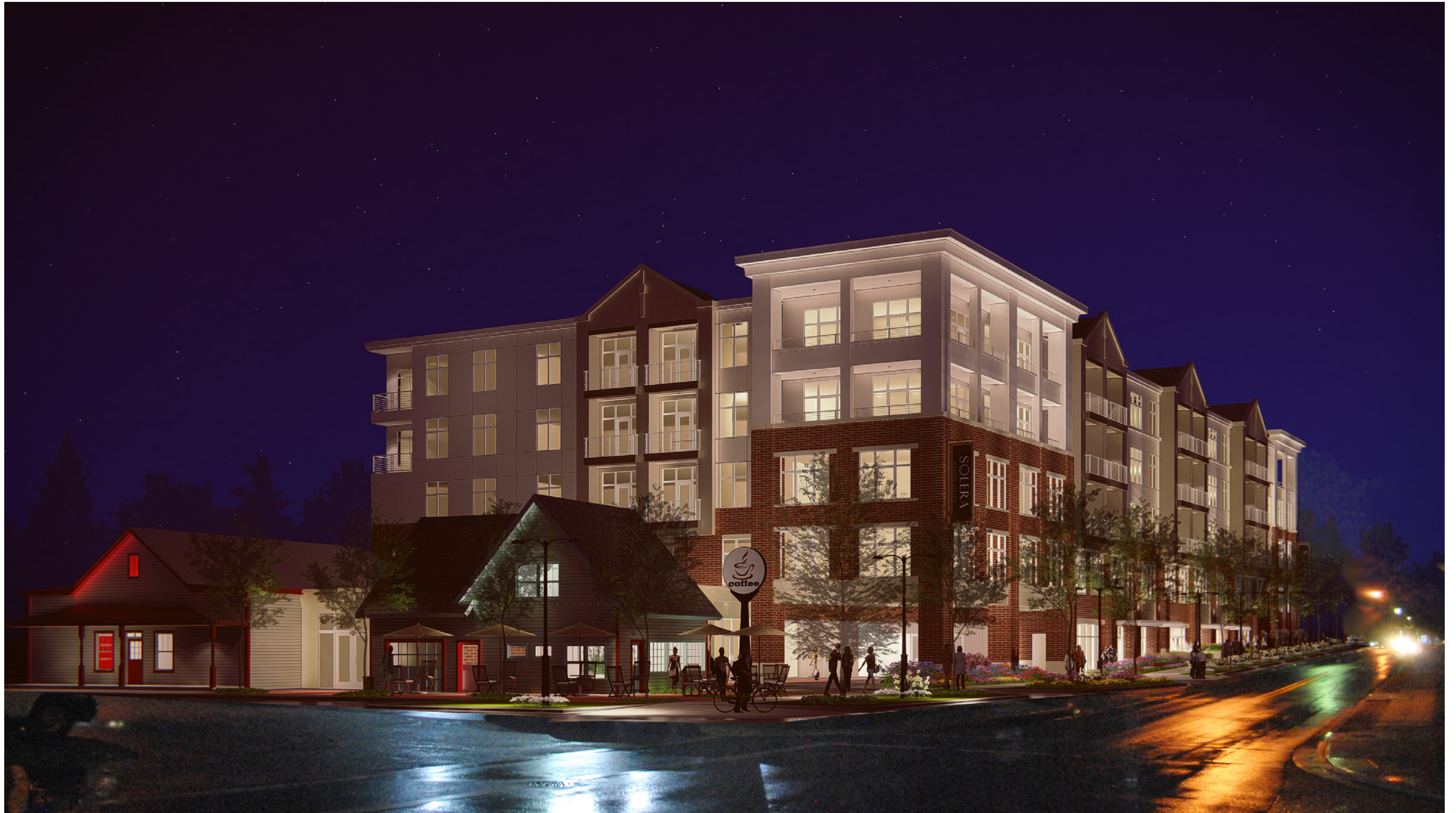
NIGHT RENDERING TAKEN AT 8:15PM