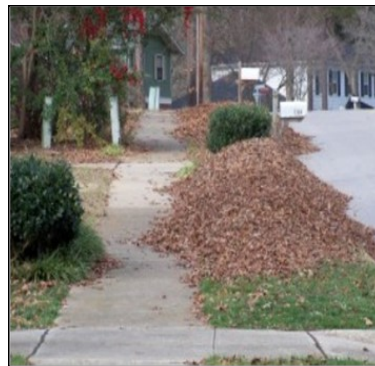
Place leaves to the curb.

Please rake your leaves to the curb, but not into the street , as this creates surface drainage issues and a possible fire hazard. Also, please refrain from parking your vehicles directly in front of or on top of the piles of leaves.