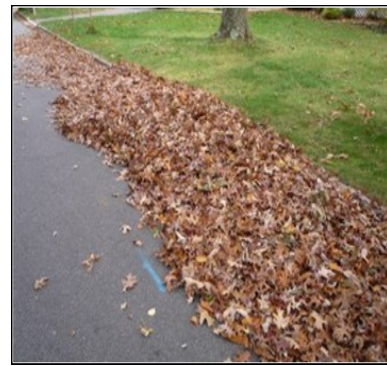
DO NOT place leaves in the street

Please note that leaf piles should consist of leaves only! By including grass clippings, mulch, twigs, and small branches within the pile, this damages our vacuum and is the number one reason for delays in the collection cycle each year. If your pile of leaves contains anything besides leaves, your pile will not be collected and you will be responsible for bagging the leaves on your own.