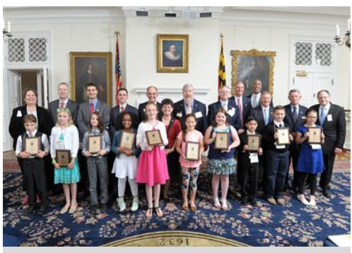
Maryland Mayors' Association If I Were Mayor Essay Contest Awards in Annapolis.

Great strides have been made in moving Kensington forward, most notably our revised Sector Plan, zoning regulations and the reversal of our liquor laws. These major modifications have laid the groundwork for the Town to revitalize properly and responsibly. Initiating some of the smaller changes are significant too, such as the "From