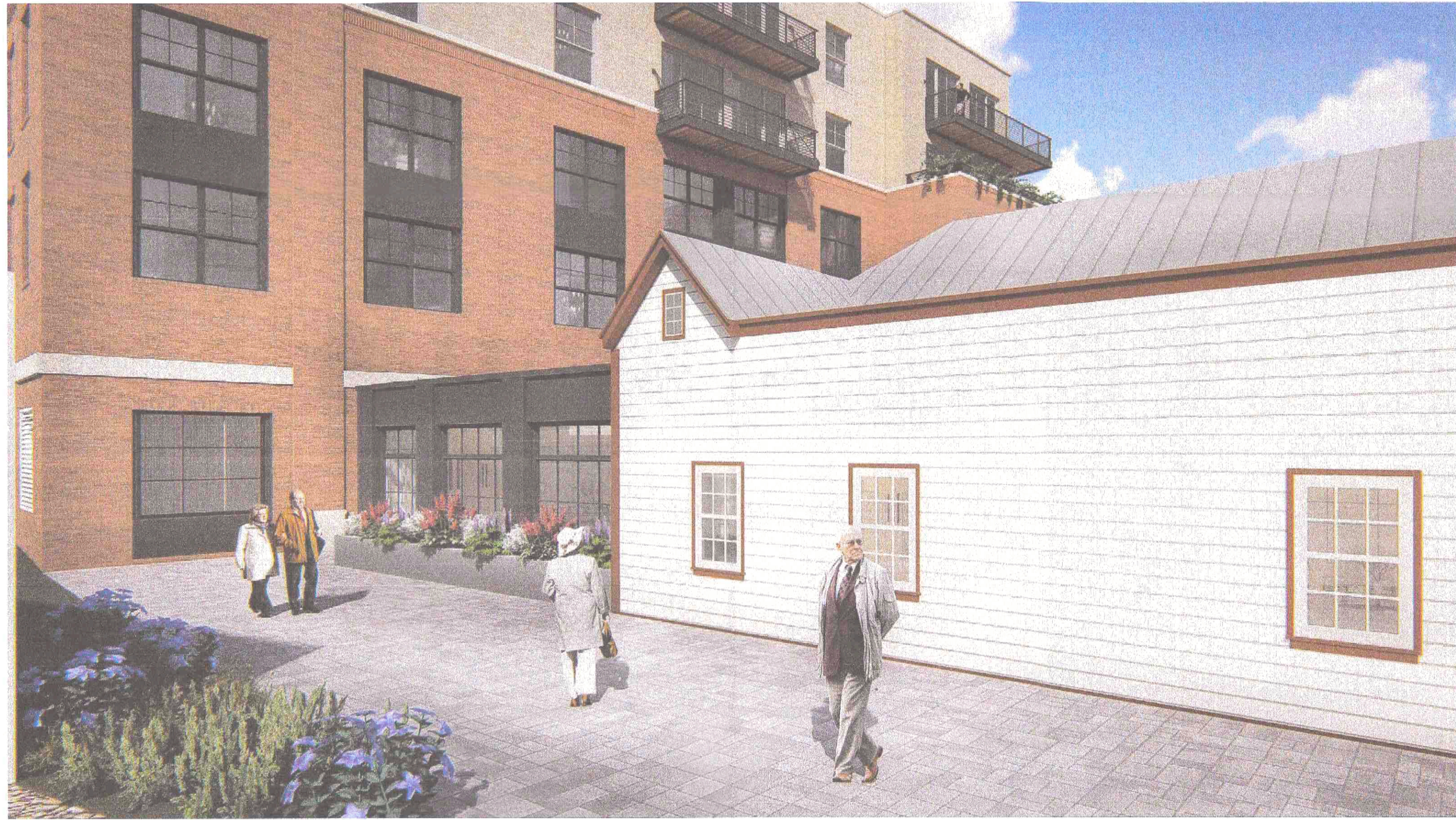
Solera Reserve Kensington