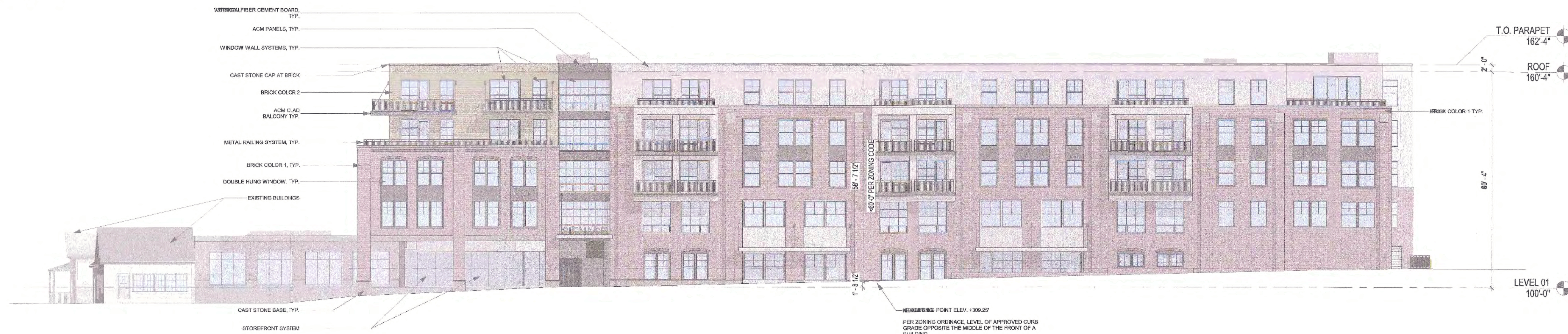
1 NORTH ELEVATION 1/16" = 1'-0"

SITE PLAN SOLERA | RESERVE KENSINGTON 10540 METROPOLITAN AVE. LOTS 6A, 6B, PT. 6, 7 MONTGOMERY COUNTY, MARYLAND 13 TH ELECTION DISTRICT PLAT 3551 & LIBER 3097, FOLD 0447, AND PLAT 24 SHEET 23/MW04 / 23/MW03, TAX MAP HP343