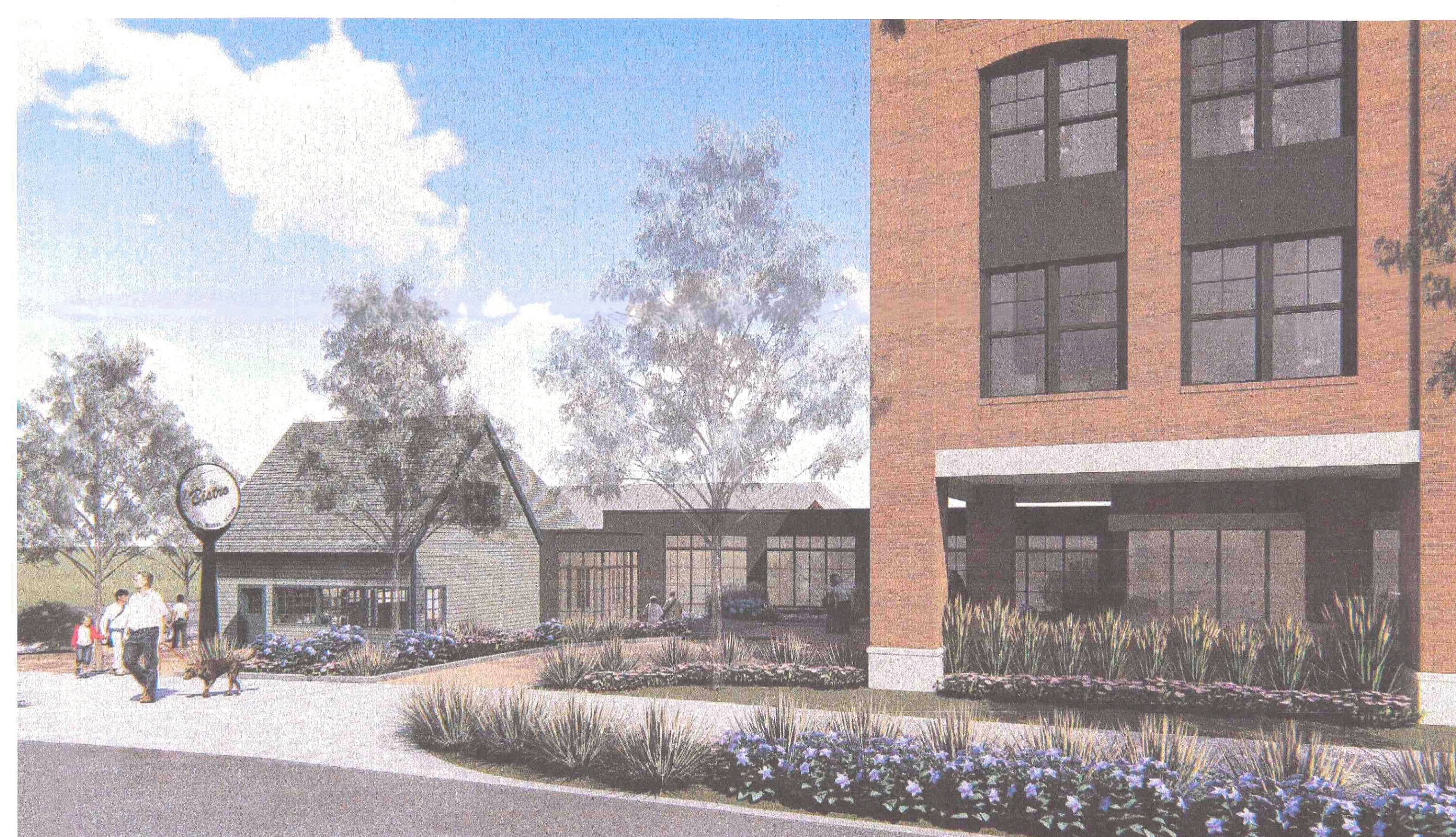
Solera Reserve Kensington