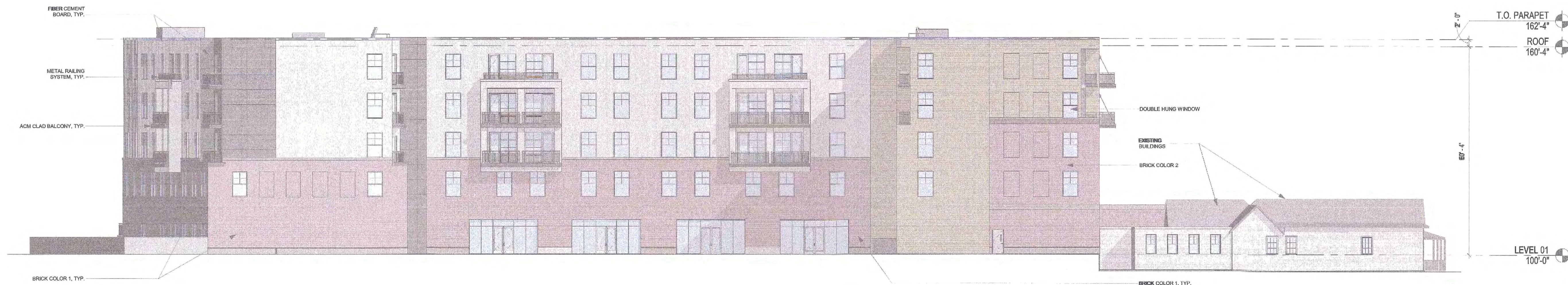
2 SOUTH ELEVATION 1/16" = 1'-0"