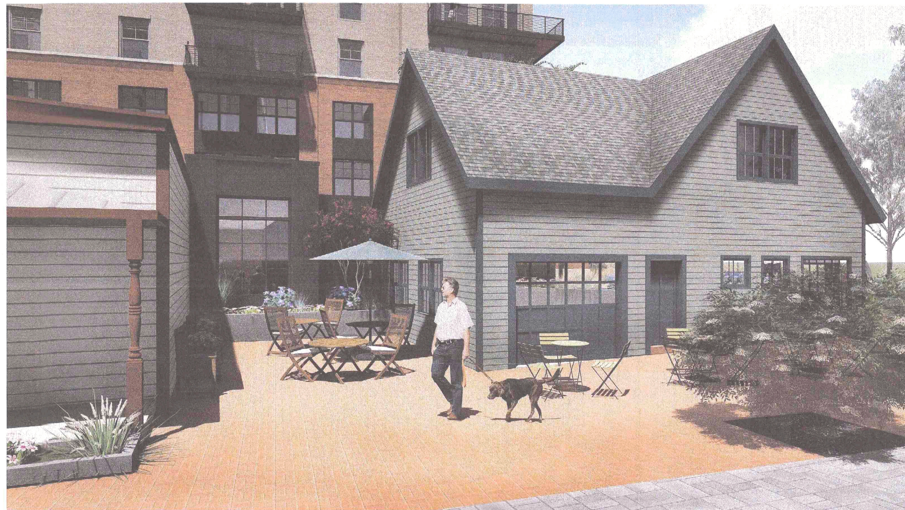
Solera Reserve Kensington