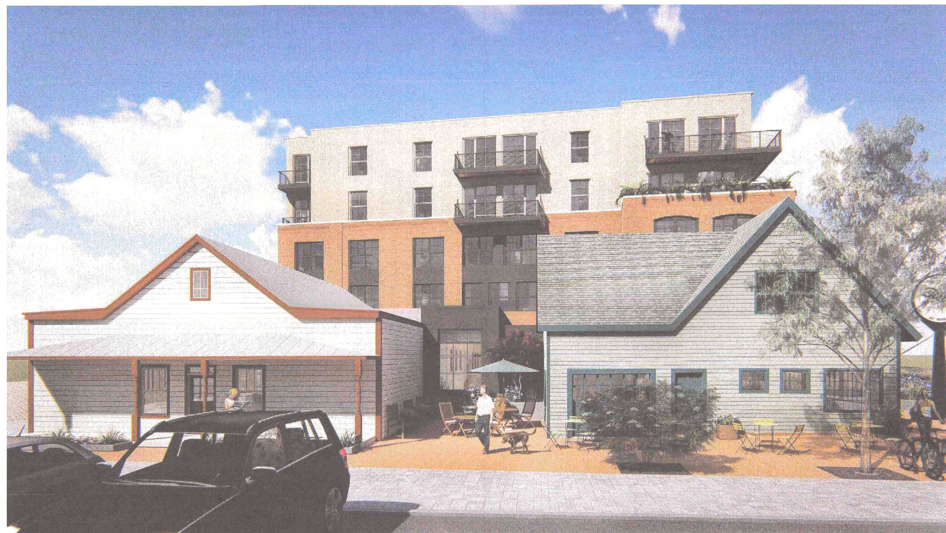
Solera Reserve Kensington