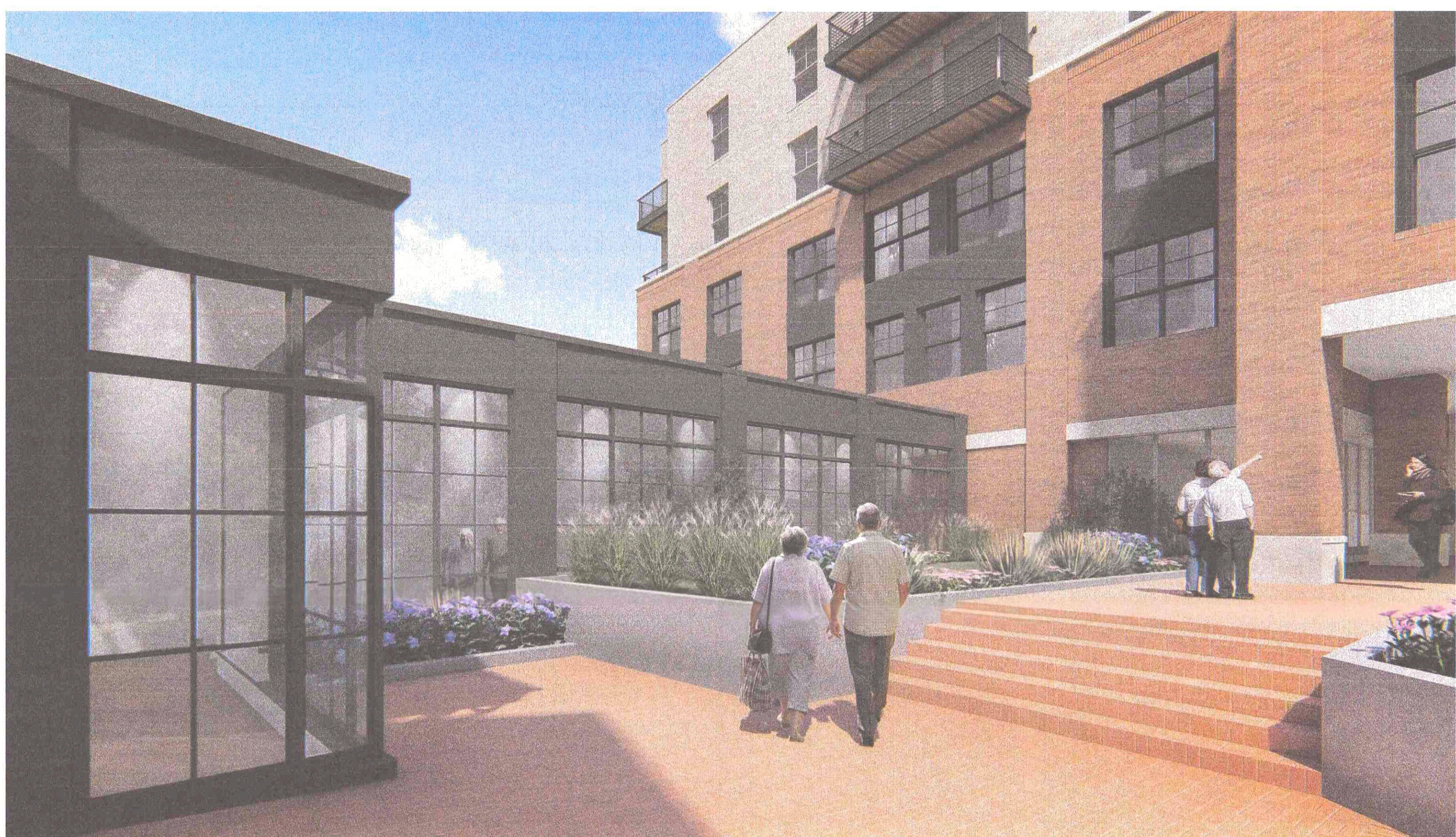
Solera Reserve Kensington