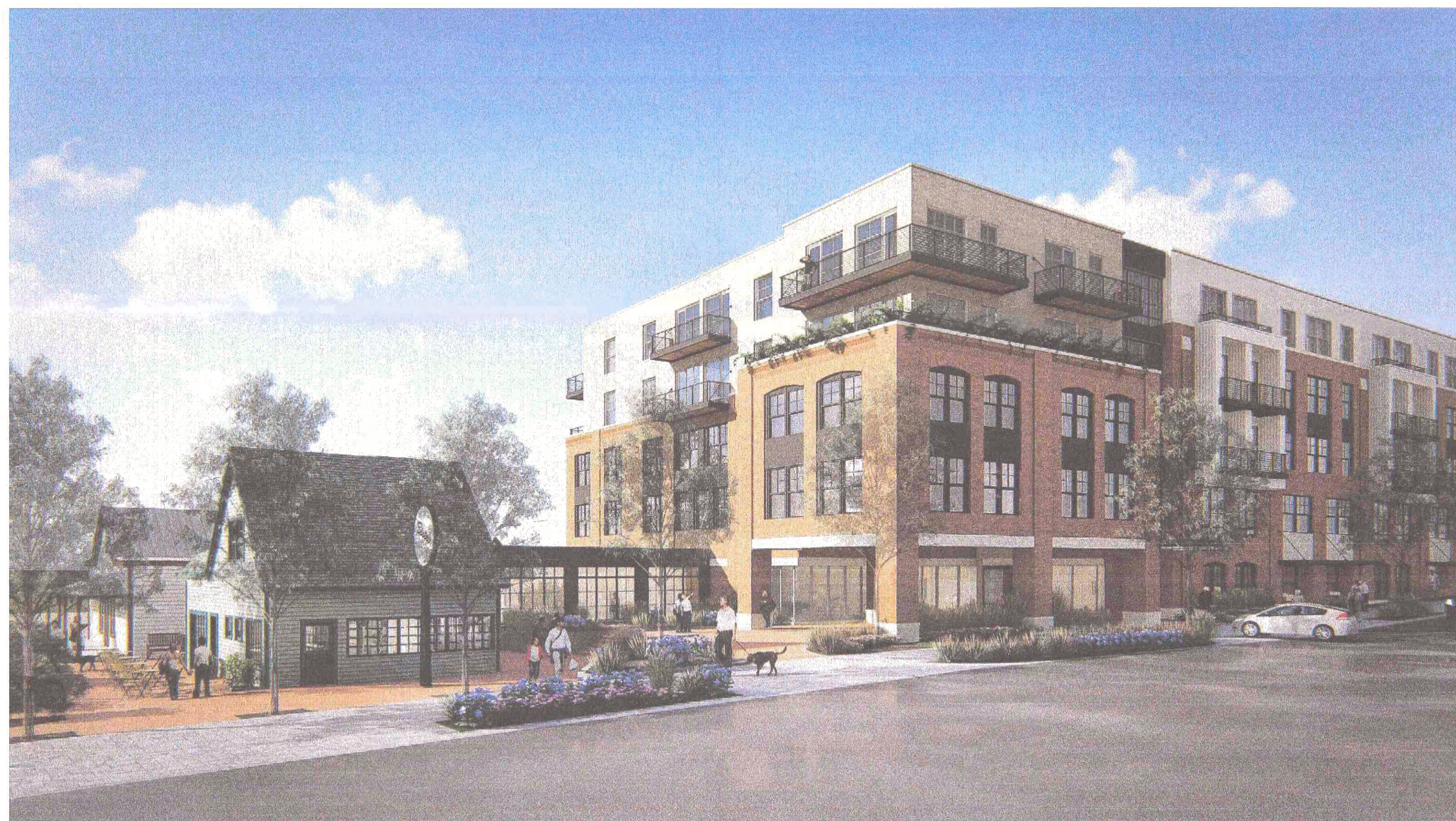
Solera Reserve Kensington

View From Metropolitan Ave &amp; St Paul St