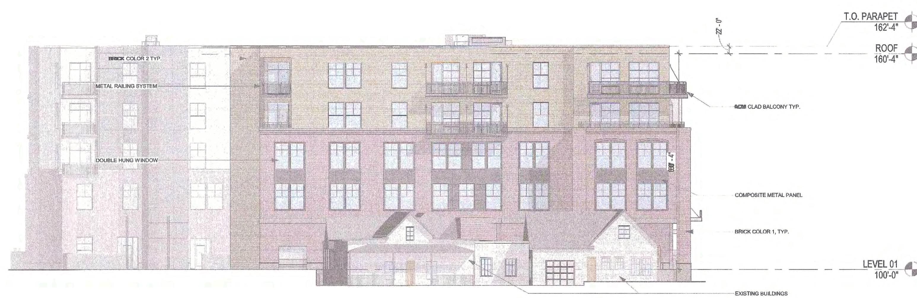
4 EAST ELEVATION 1/16" = 1'-0"