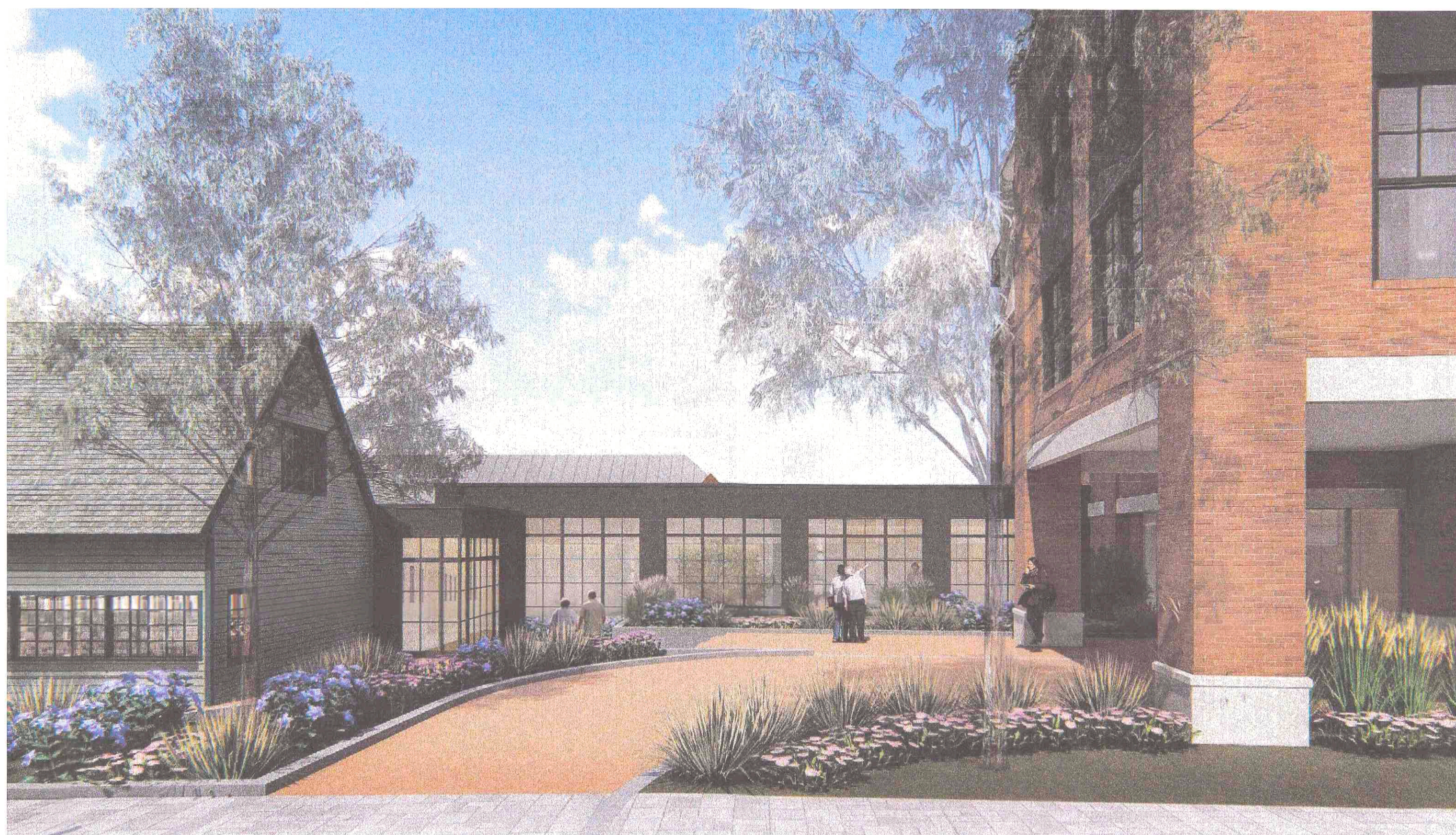
Solera Reserve Kensington