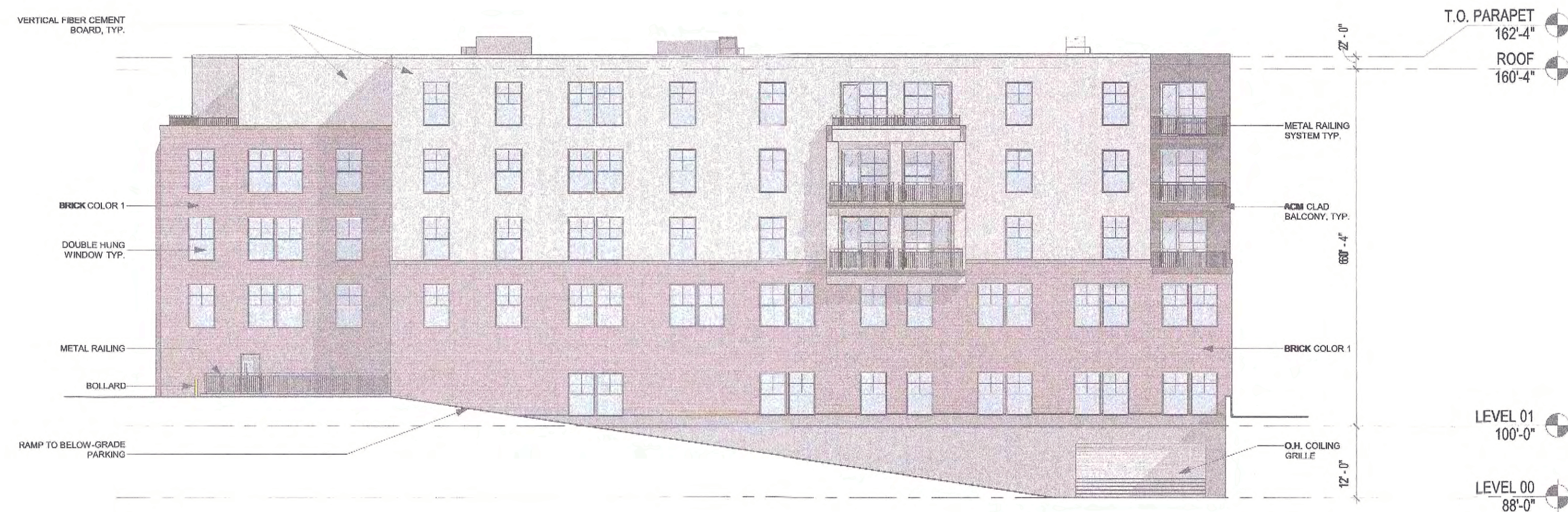
3 WEST ELEVATION 1/16" = 1'-0"