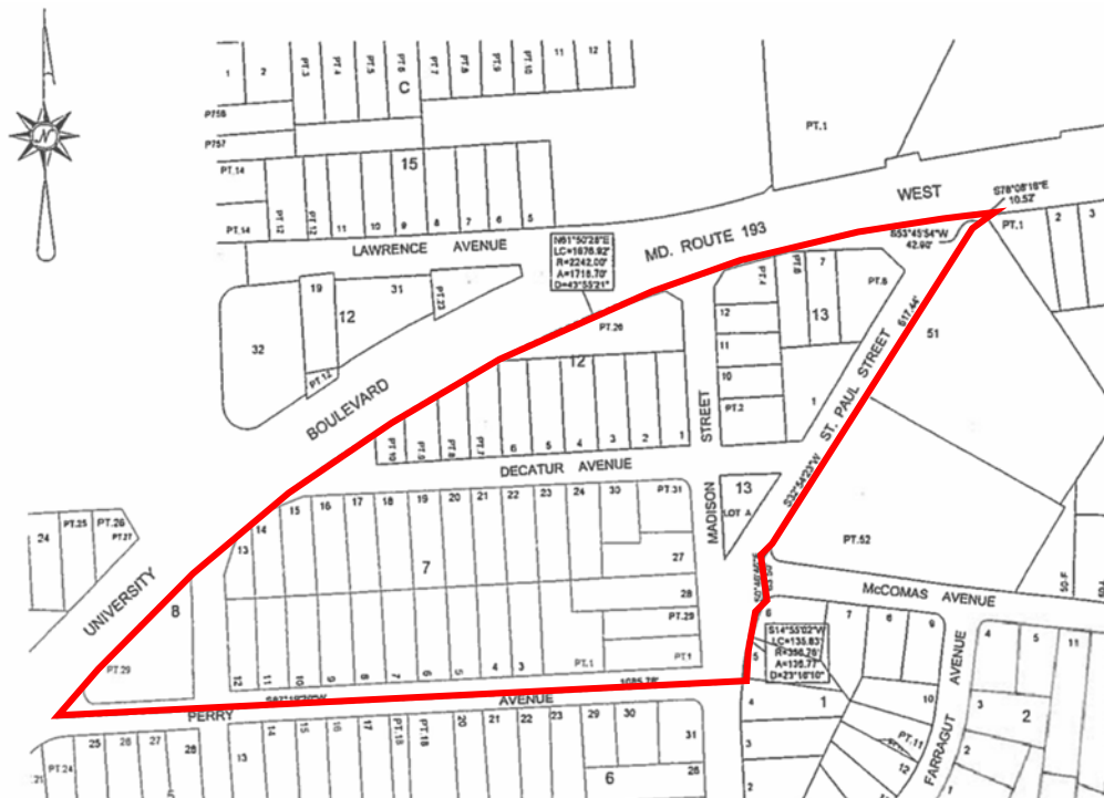
Figure 1: Town of Kensington proposed annexation area.

The Town of Kensington hosted a public hearing on August 13, 2018 and the Town Council is tentatively scheduled to act on the annexation petition on September 10, 2018.