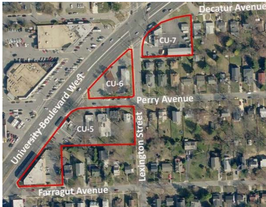
Figure 2: Analysis Areas of Connecticut Avenue/University Boulevard (CU-6 and CU-7) in the 2012 Kensington Sector Plan .

The CU-6 property located at 3700 University Boulevard West is zoned CRN 1.0: C1.0, R0.5, H-45. The four CU-7 lots located at 3606-3610 Decatur Avenue and 3610 University Boulevard West, at the southeast intersection of Lexington Street, University Boulevard West and Decatur Avenue, are zoned CRN 1.0: C0.75, R1.0, H-45. All single-family dwellings along Decatur Avenue, Perry Avenue, St. Paul Street, Madison Street and University Boulevard are zoned R-60 (Figure 3). Since the Town does not have planning and zoning authority, upon annexation, the subject area will maintain the existing zoning and uses. Any new development within the annexed area will follow the requirements of the Montgomery County Zoning Ordinance and the guidance of the 2012 Kensington Sector Plan .